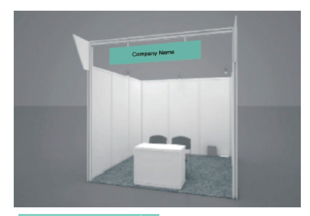
Design 1: 50/m<sup>2</sup>